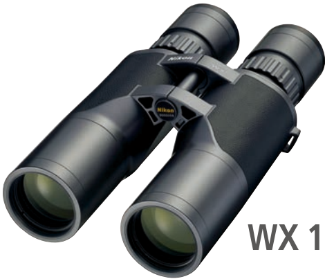
WX 10×50 IF