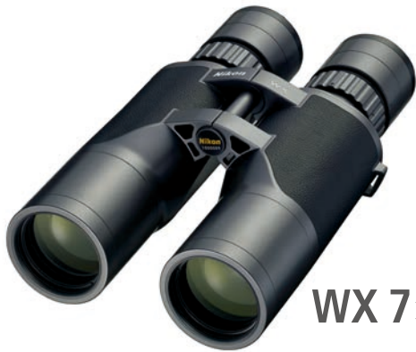
WX 7×50 IF