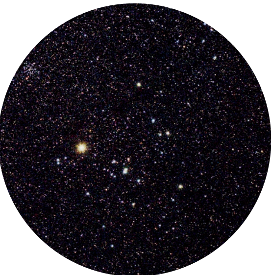
WX 7×50 IF Super-wide and flat field of view

The Field Flatteners Lens System is employed for compensating curvature of field from the centre to the very edge of the periphery. While realising a super-wide field of view, it assures a sharp and clear image across the entire field of view. The super-wide field of view allows you to take in a wide-sweeping view of star clusters or galaxies, while individual stars can be clearly seen as sharp points.